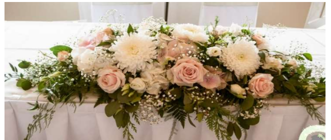
Centerpiece 2 (Medium) 90€