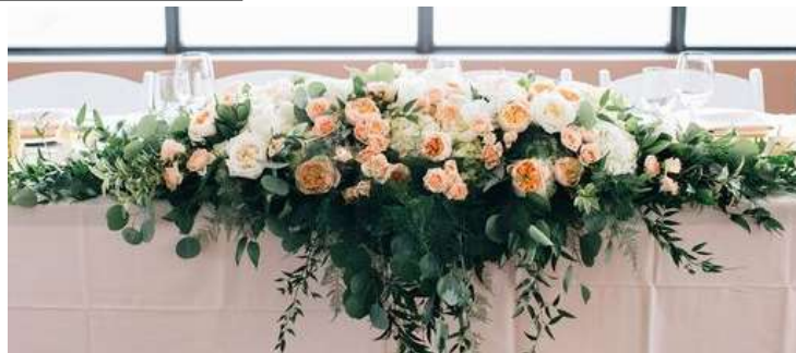
Centerpiece 3 (Large) 120€