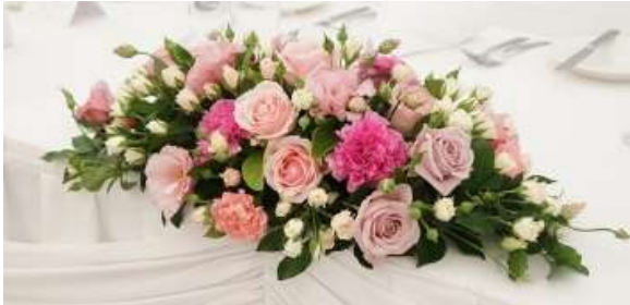
Centerpiece 1 (Small) 80€